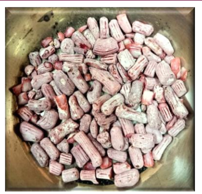
Fig 4: After purification - Kodipavalam

Fig 3: Before purification – Kodipavalam Preparation method of Annapavala chendhuram <sup>[8]</sup>