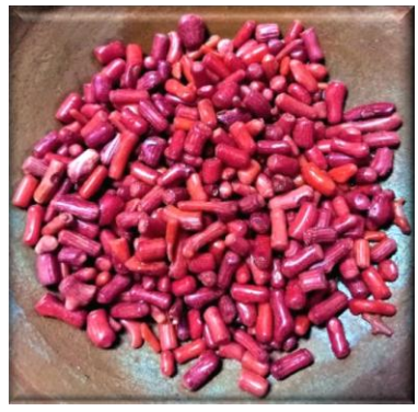
Fig 3: Before purification – Kodipavalam Preparation method of Annapavala chendhuram <sup>[8]</sup>

Sabari Girija N et al . Angiotensin Converting Enzyme Inhibition Potential of Annapavala Chendhuram for the Treatment of Hypertension