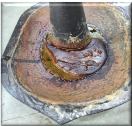
Fig 7: Grinding of Annabedhi