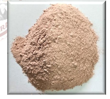
Fig 6: Fine powder of Kodipavalam