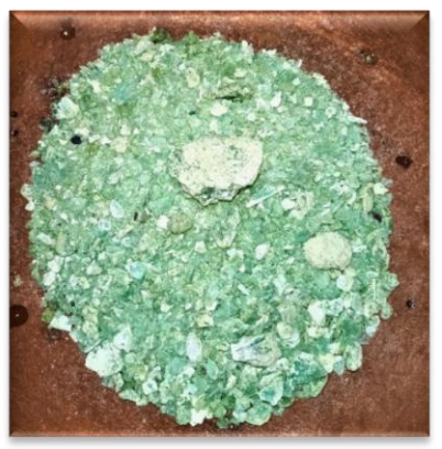
Fig 1: Before purification – Annabedhi