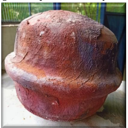
Fig 8: Villai in clay sealed earthen vessel Kodipavalam with lemon juice