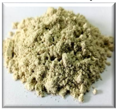
Fig 5: Fine powder of Annabedhi

Preparation method of Annapavala chenduram