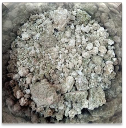
Fig 2: After purification - Annabedhi