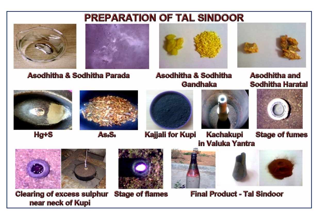
Plate 1: Preparation of Tal Sindoor