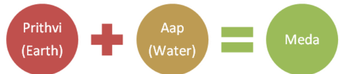
Fig. 01: Composition of Medo Dhatu

Panchbhautika Swarupa of Meda Dhatu: Meda Dhatu is considered as Sneha dominant Drava Dham which is having Guru (heavy), Snigdha (oiliness), Balakaraka and Brimhanam [5] properties and dominance of Prithvi , and Apa Mahabhoota . [6,7]