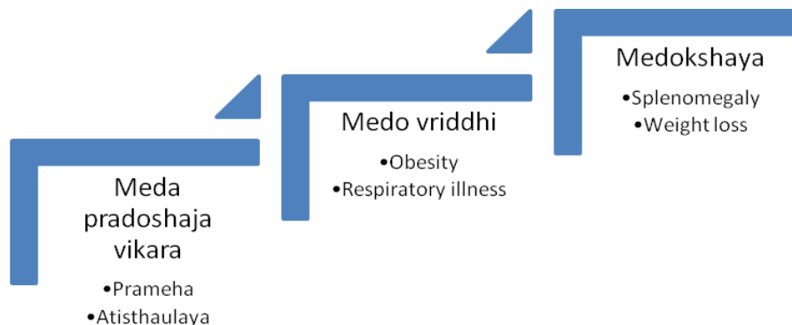
Fig. 03: Pathological conditions pertaining to Meda Dhatu

activity of the Agni maintained healthy state while its abnormal state produces pathology and its absence causes of death that why Agni is known as Moola or vital force. [21] Human body is derived from food, and the healthy and disease conditions of the body results due to the status of digestion. Digestion is to be performed by three types of Agnis viz., Jatharagni , Dhatvagni and Bhutagni . Jatharagni is the chief metabolic principle responsible for giving strength to the Bhutagnis as well as the Dhatvagnis . Agni digests the four types of ingested Ahara and provides energy for sustaining life. It protects body from wear and tear. Hence Agni performs the functions of digestion and metabolism both.