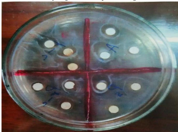
Zone of inhibition of Escherichia Coli Sp

other two drugs either crude or sterile from proves the qualities of the Ayurvedic formulation in context to Antimicrobial activity is accelerated may be due to that during the sterilization process of those drugs, through seitz's filter some effective constituent are being radically activated which are not profound in context to the administration of the plants in its crude form.