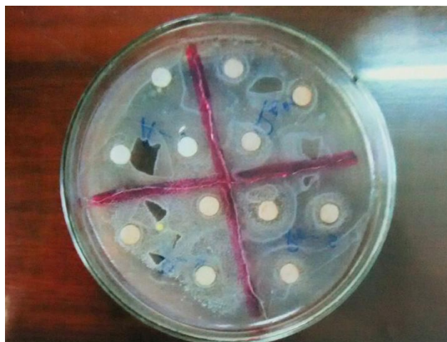
Zone of inhibition of Klebsiella Sp.