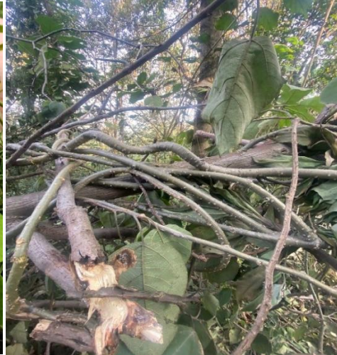
Figure 2: Showing stems of Tinospora cordifolia Wild. & Miers.