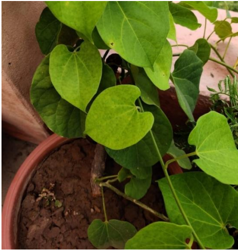
Figure 1: Showing leaves of Tinospora cordifolia Wild. & Miers.

The macroscopic and microscopic study of Giloye (Tinospora Cordifolia Wild. & Miers.) was shown in [Figure 1-5]