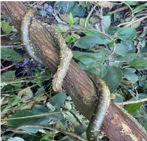
Figure 3: Showing stem of Tinospora cordifolia Wild. & Miers. in circular way satisfying its Kundli synonym in Ayurveda