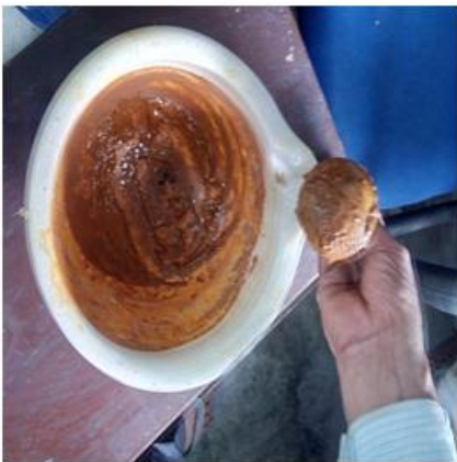
Trial 1 Sample C