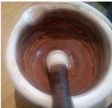
Trial 3 Sample A