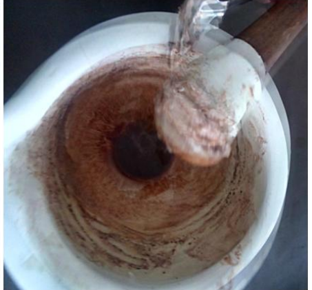
Trial 4 Sample B