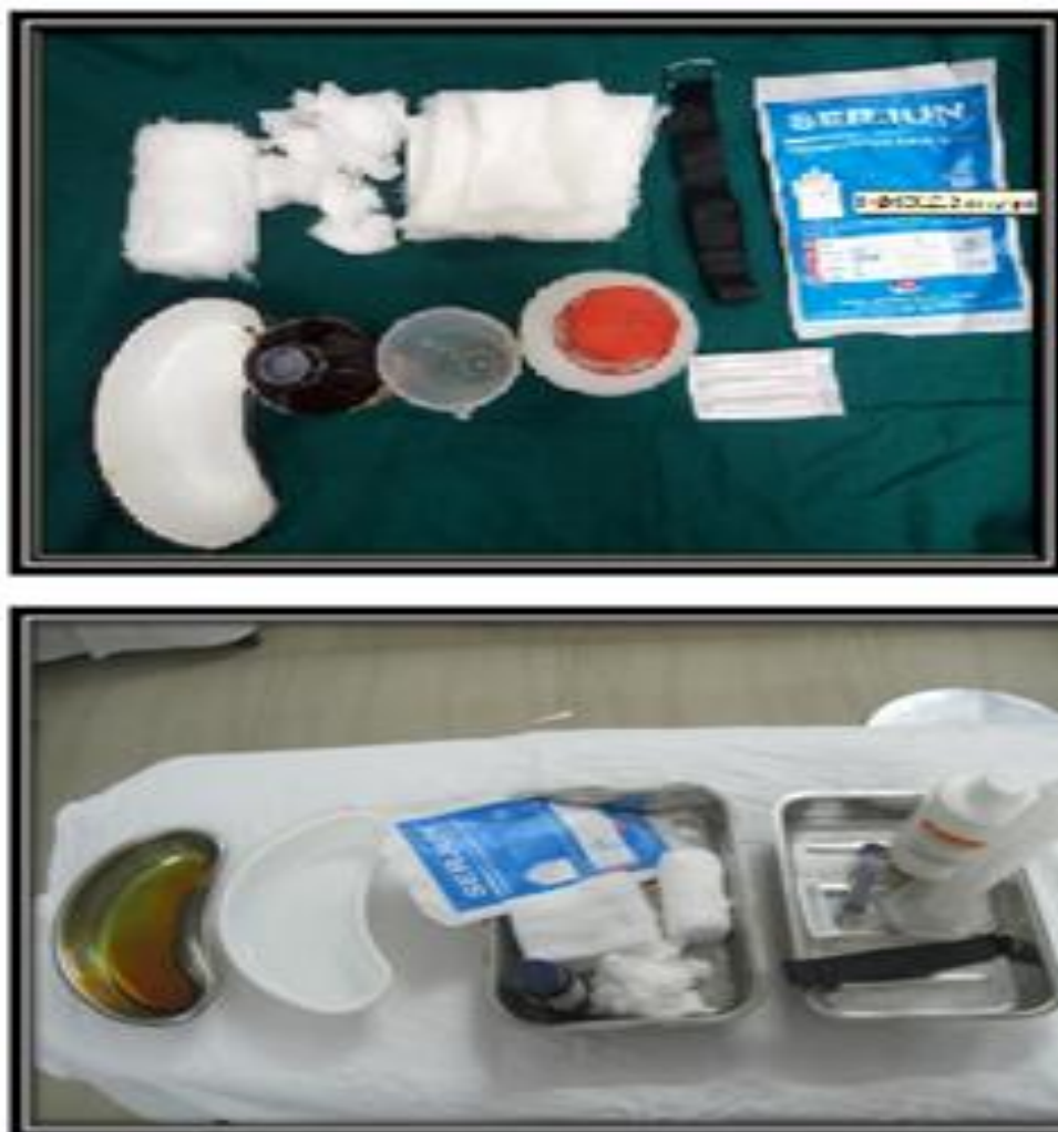
Figure 3: Instruments used for Siravyadha