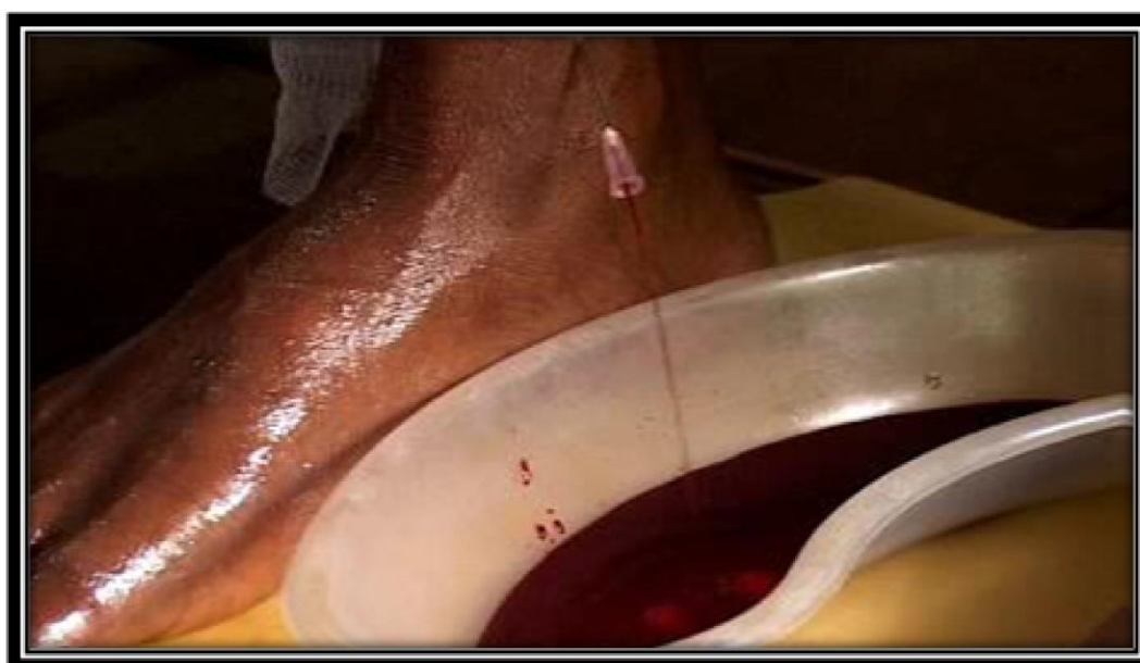
Figure 4: Procedure Showing Siravyadha