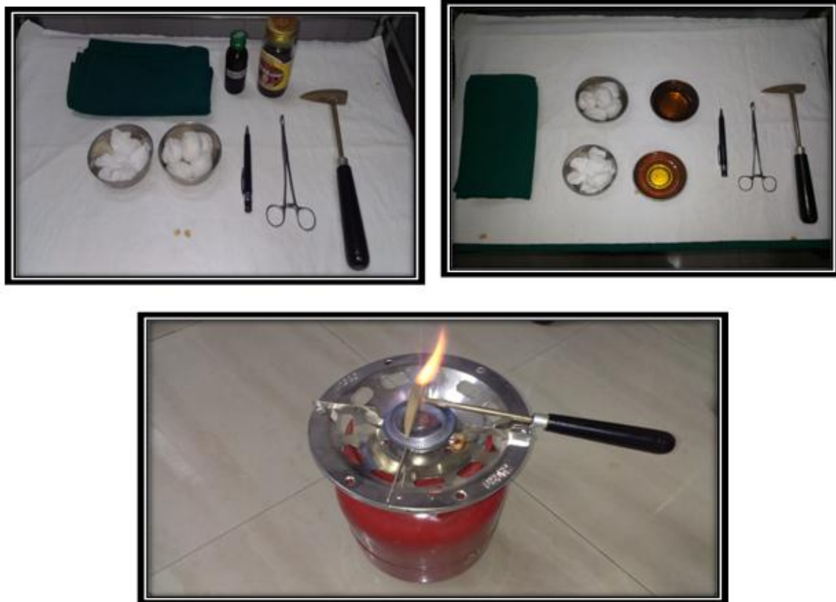
Figure 1: Instruments used for Agnikarma