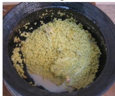
Fig 9. First wash with hot water