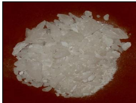
Figure 7: Tankana kshara