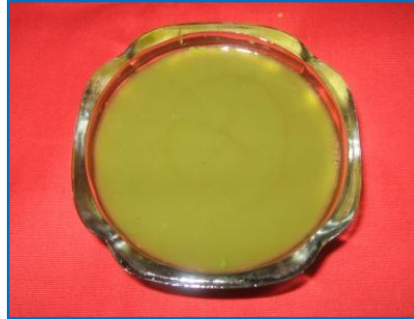
Figure 3: Nagavalli svarasa