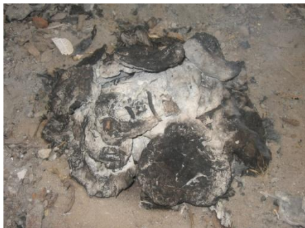
Fig 7. Burned cow dung cakes