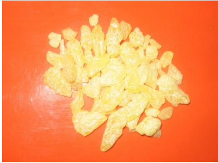
Fig 1. Raw (Impure) Gandhaka