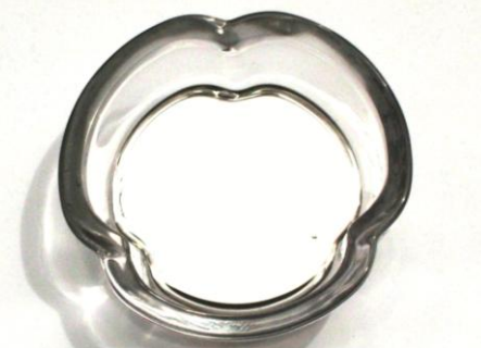
Pure Parada after Shodhana