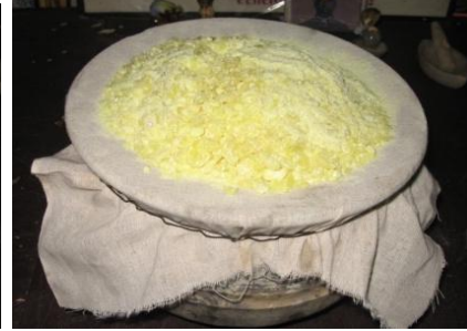
Fig 4. Spread of Gandhaka over the cloth