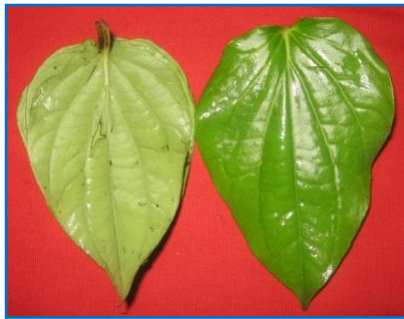
Figure 2: Nagavalli leaves