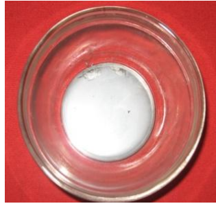
Figure 1: Parada