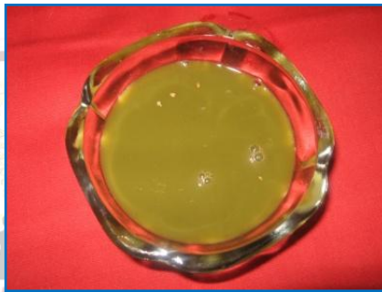
Figure 5: Ardraka svarasa