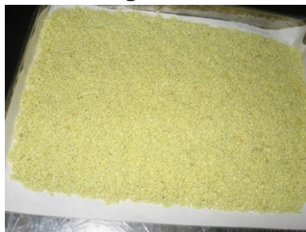
Fig 10. Purified Gandhaka