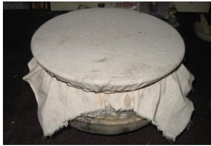
Fig 3. Covered by a cloth and tied by iron wire