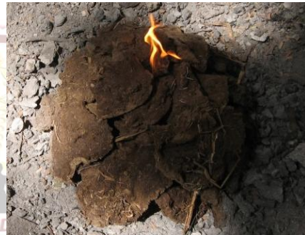
Fig 6. Cow dung cakes with fire