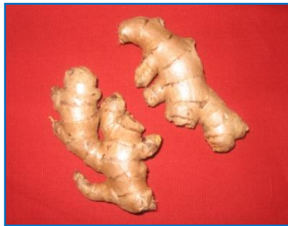
Figure 4: Ardraka