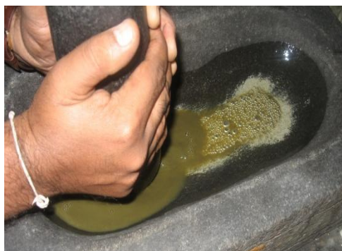
Mercury Globules During Mardhana