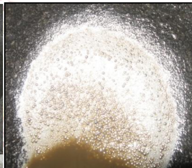
Mercury Globules During Mardhana