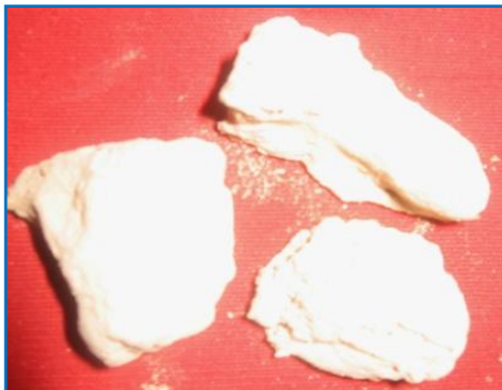
Figure 6: Sarja kshara