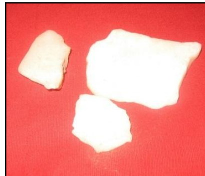
Figure 7: Yava kshara