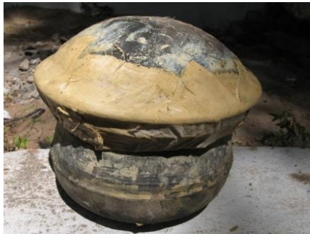
Fig 5. Closed and sealed with another vessel