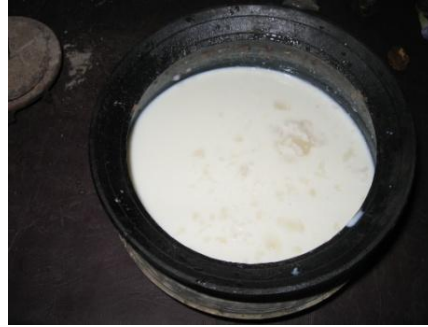
Fig 2. Earthen vessel with Milk and Ghee