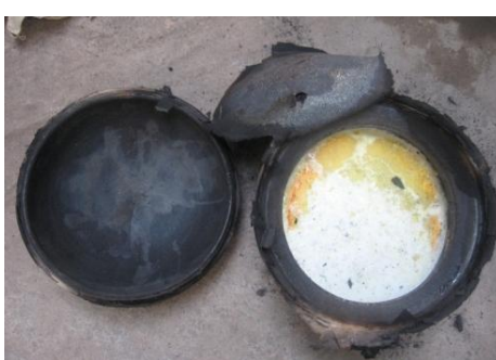
Fig 8. After self cooling opened seal