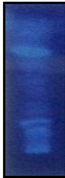
Under Long UV