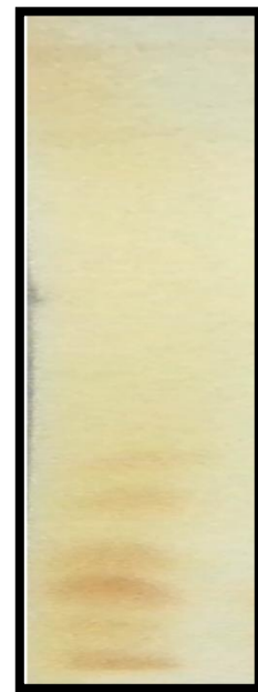
After spraying dragendroff's reagent