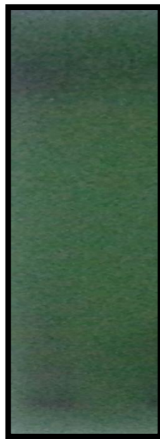
Under Short UV