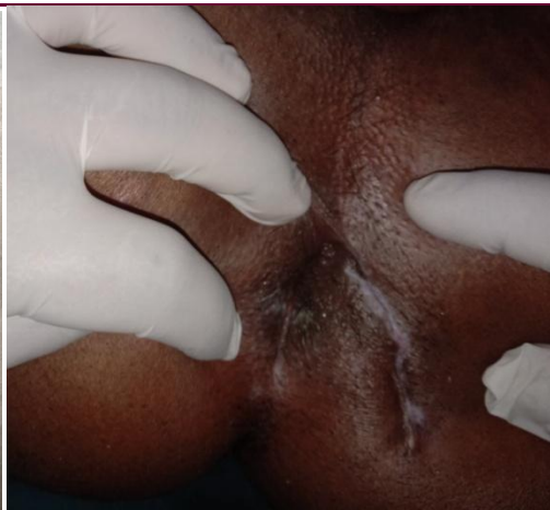
Fig 2 After treatment