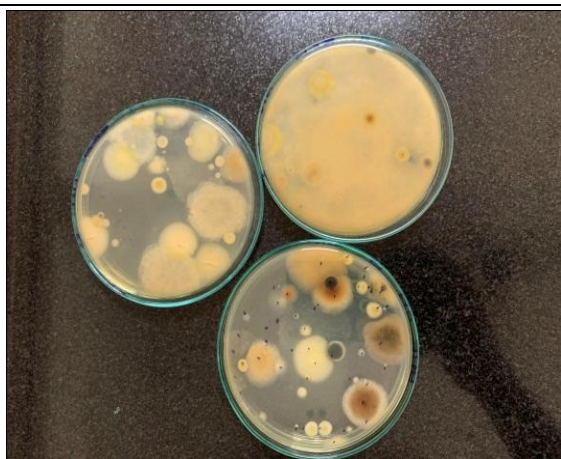
Yeast and mould cfu/m 3 before fumigation