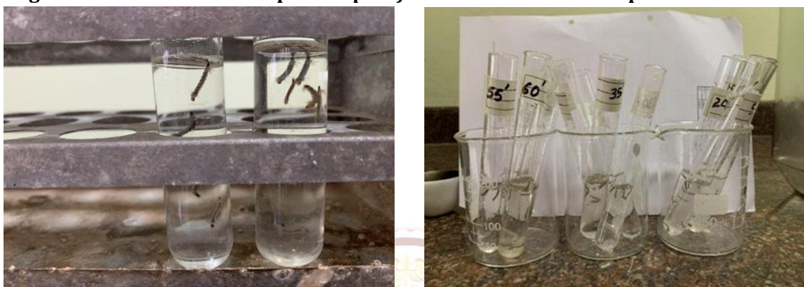
Fig 5: The test tubes with larvae for exposure studies. Larvae exposed for 0, 5 10, 15, 20, 25, 30, 35, 40, 45, 50, 55 and 60 minute intervals.

Moribund larvae were those unable to rise to water surface or show diving action on disturbing water. These were also counted along with dead larvae so as to calculate percentage mortality. Bioassays were done in triplicate and bioassay results reported.