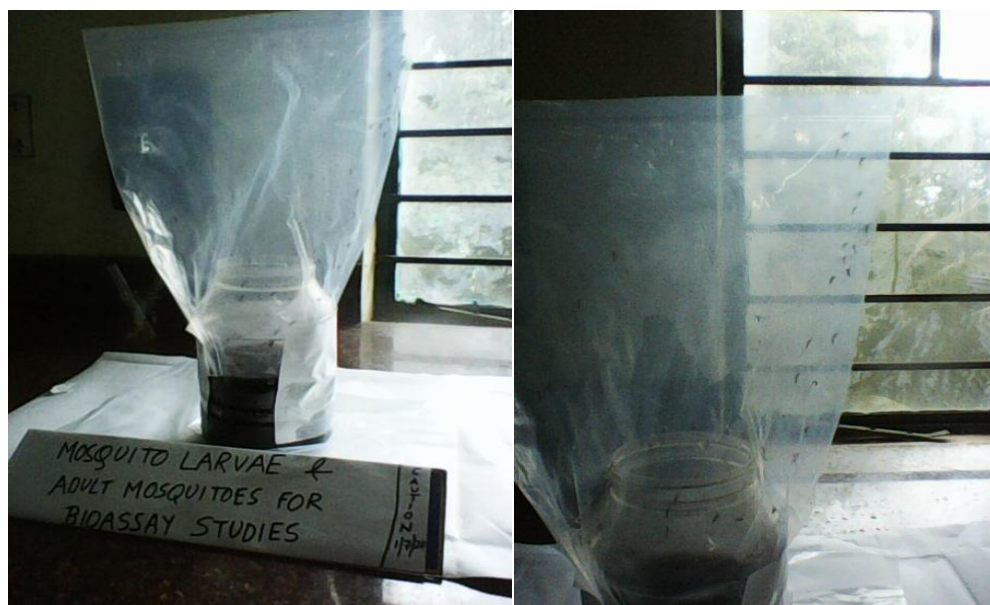
Fig 7: Mosquitoes trapped in polythene bag for bioassay