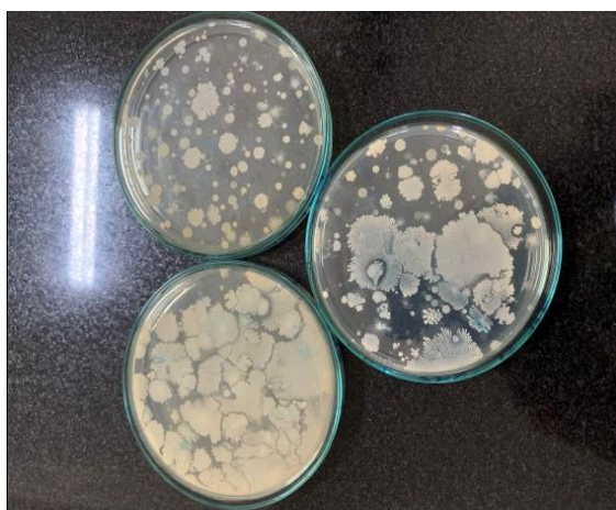
Bacterial cfu/m 3 before fumigation