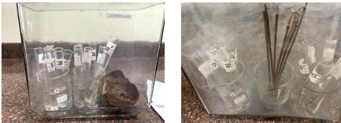
Fig 4: Solvent chamber set up with Aparajitha dhooma choornam powder and sticks