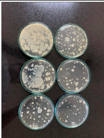
SPC plates before fumigation