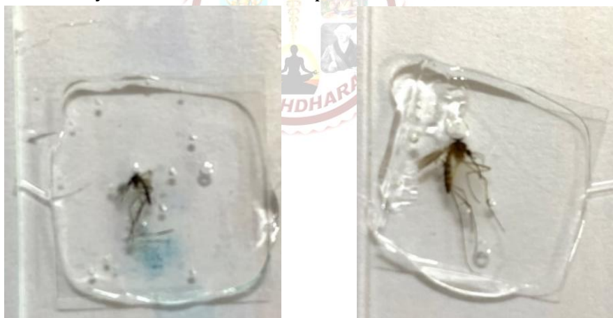
Fig 3: Mosquitoes which were obtained during knockout were fixed using DPX mountant and then later viewed under the Research trinocular microscope for identification characteristics.

Mosquito collections were made from their natural breeding habitats from gardening areas as well as outdoor bushes. Sampling of larvae was made from rainwater pools and empty pots. The larvae were reared in a temperature controlled space at 25 \pm 5^\circ\text{C} and 80\% \pm 10\% relative humidity so that both larvae and adults could be assayed in the laboratory of Research and Development Centre, Oushadhi.