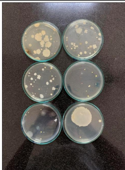
SPC plates after fumigation