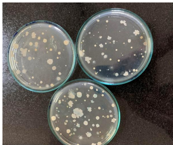
Bacterial cfu/m 3 after fumigation