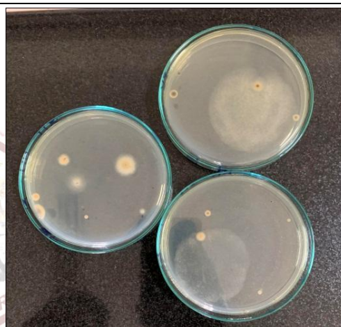
Yeast and mould cfu/m 3 after fumigation