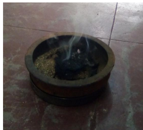
Fig 2: Packing unit, Aparajitha dhooma choornam powder was smoked