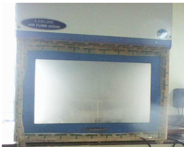
Fig 6: Modified mosquito bioassay chamber -Fume hood filled with smoke after fumigation with Aparajitha dhooma choornam

Exposure of adult mosquitoes was done using a modified fume hood set up. Aparajitha dhooma choornam powder or sticks were lit and the fumes allowed to fill in the fume hood. This was somewhat similar to the method used by Jaswanth et al. [9] 20-25 adult mosquitoes were placed in plastic bags with holes small enough to prevent escape of mosquitoes but large enough to allow entry of gases. Knockdown score was taken by counting the mosquitoes that were unable to fly or were on their backs. Knock-down times were determined by visual analysis.