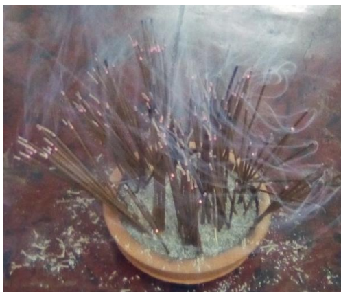
Fig 1: Research and Development formulation unit Aparajitha dhooma choornam sticks were lit

In the present study, comparison of fumigation using conventional Aparajitha dhooma choornam powder and Aparajitha dhooma choornam sticks was carried out.