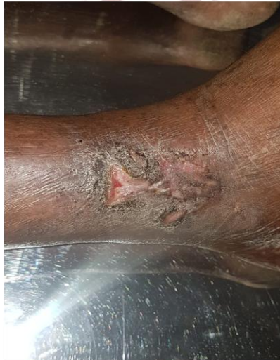
2 nd sitting