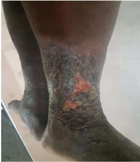
Fig. No 1 Before treatment