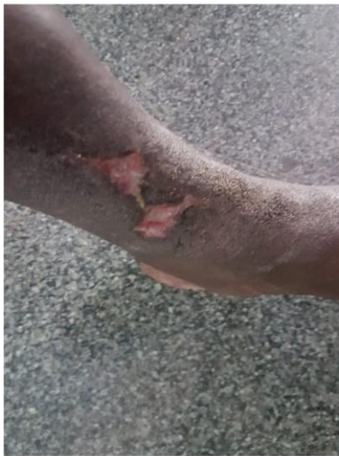
1 st sitting