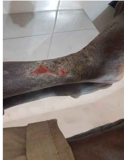
Fig. No 2 After Shodhana