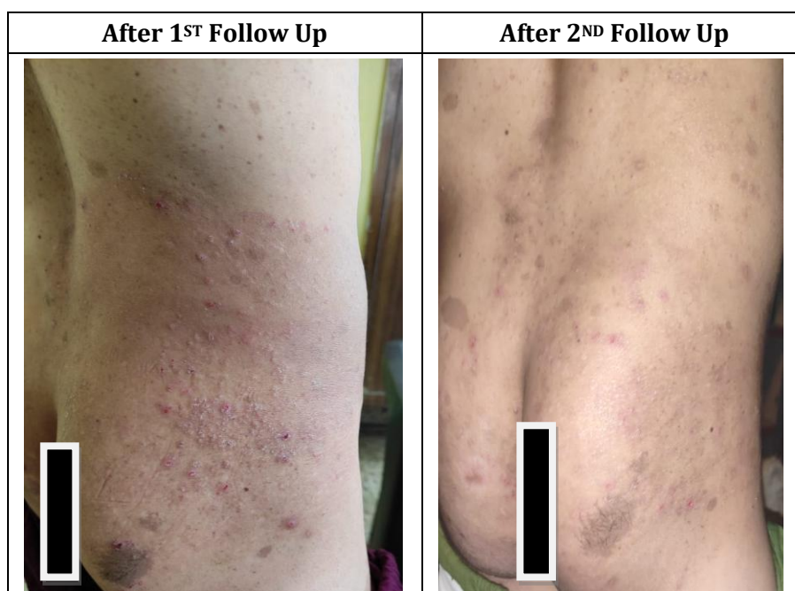
Table 4: Jaloukavacharana Treatment Before and After Treatment